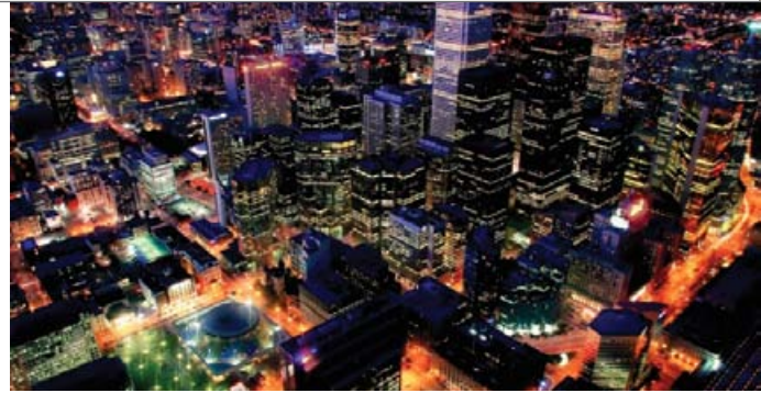
Toronto's business district: Canada's financial capital

The Cold War began when several liberated countries of eastern Europe became part of a Communist bloc controlled by the Soviet Union under the dictator Josef Stalin. Canada joined with other democratic countries of the West to form the North Atlantic Treaty Organization (NATO), a military alliance, and with the United States in the North American Aerospace Defence Command (NORAD).