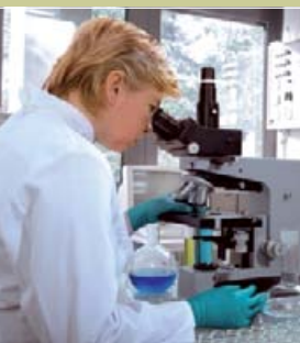
A medical researcher

The movement for Quebec sovereignty gained strength but was defeated in a referendum in the province in 1980. After much negotiation, in 1982 the Constitution was amended without the agreement of Quebec. Though sovereignty was again defeated in a second referendum in 1995, the autonomy of Quebec within Canada remains a lively topic—part of the dynamic that continues to shape our country.