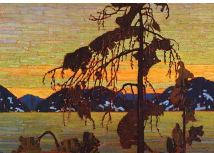
The Jack Pine, Tom Thomson

As social values changed over more than 50 years, Canada became a more flexible and open society. Many took advantage of expanding secondary and postsecondary educational opportunities and a growing number of women entered the professional work force.