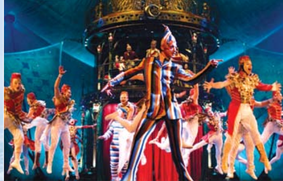
(From Left to Right) Vietnamese Canadian parade F-86 Sabre, Royal Canadian Air Force Cirque du Soleil