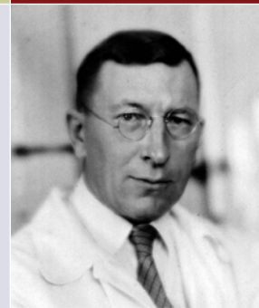
Sir Frederick Banting of Toronto and Charles Best discovered insulin, a hormone to treat diabetes that has saved 16 million lives worldwide

Want to learn more about Canada’s history? Visit a museum or national historic site! Through artifacts, works of art, stories, images and documents, museums explore the diverse events and accomplishments that formed Canada’s history. Museums can be found in almost every city and town across Canada. National historic sites are located in all provinces and territories and include such diverse places as battlefields, archaeological sites, buildings and sacred spaces. To find a museum or national historic site in your community or region, visit the websites of the Virtual Museum of Canada and Parks Canada listed at the end of this guide.